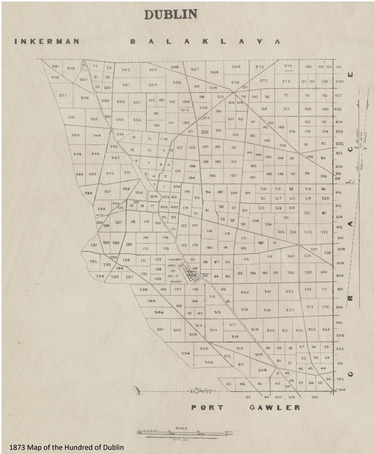
1873 Map of the Hundred of Dublin

http://nla.gov.au/nla.news-article49746084